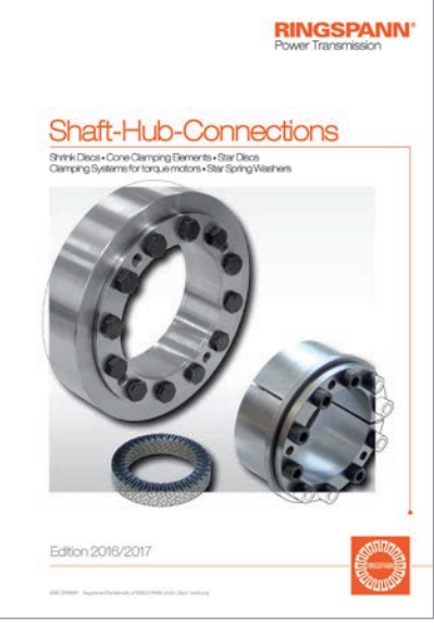
The new 2016/17 product catalogue provides a complete overview of the current and extended RINGSPANN range of two and three-part shrink discs and cone clamping elements as well as star discs, torque motor clamping systems and star spring washers.

ping systems and star spring washers for ball bearing compensation. On over 80 pages, all shaft-hubconnections are practically and very clearly described with colour technical images, drawings, data tables and short texts. In the catalogue, RING-SPANN also presents its innovative online calculation tool, which enables design engineers, product developers and purchasers to perform an individual and highly precise dimensioning of the optimal shafthub-connection.